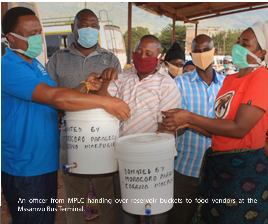
An officer from MPLC handing over reservoir buckets to food vendors at the Msamvu Bus Terminal.

In the town of Morogoro where MPLC is based its officers provided prevention education to women food vendors at the Msamvu Bus Terminal especially because of the large numbers of people they regularly serve and routinely come into contact with. Further