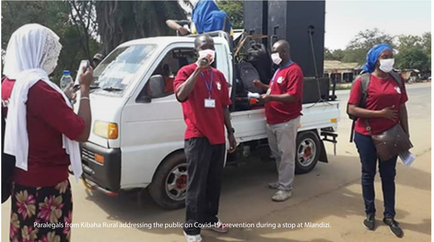
Paralegals from Kibaha Rural addressing the public on Covid-19 prevention during a stop at Mlandizi.

The onset of Covid-19 signaled the beginning of a new normal for nearly every aspect of life including access to justice. Across Pwani where the Centre for Environmental Law and Governance (CELG) mentors nine paralegal organizations project activities that provide legal aid and education to citizens like in countless other areas of the country have been forced to assume new approaches.