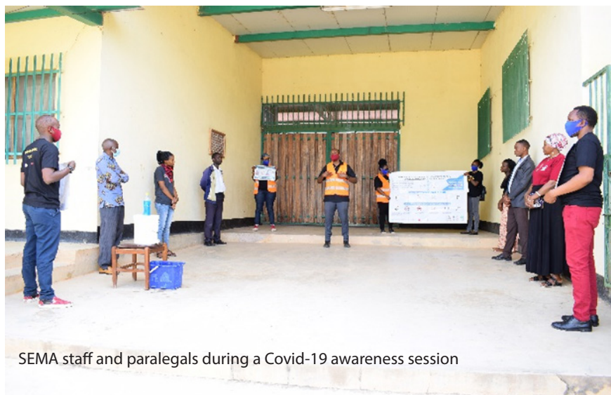
SEMA staff and paralegals during a Covid-19 awareness session

In Kagera, Mama's Hope Organization for Legal Aid (MHOLA) has distributed protective equipment and hygiene products such as reservoir buckets, liquid soap, sanitizers, face masks, clinical gloves and cash intended for fuel costs to aid the distribution of the donations to the districts councils of Muleba, Karagwe and Ngara and to paralegal units based in the districts.