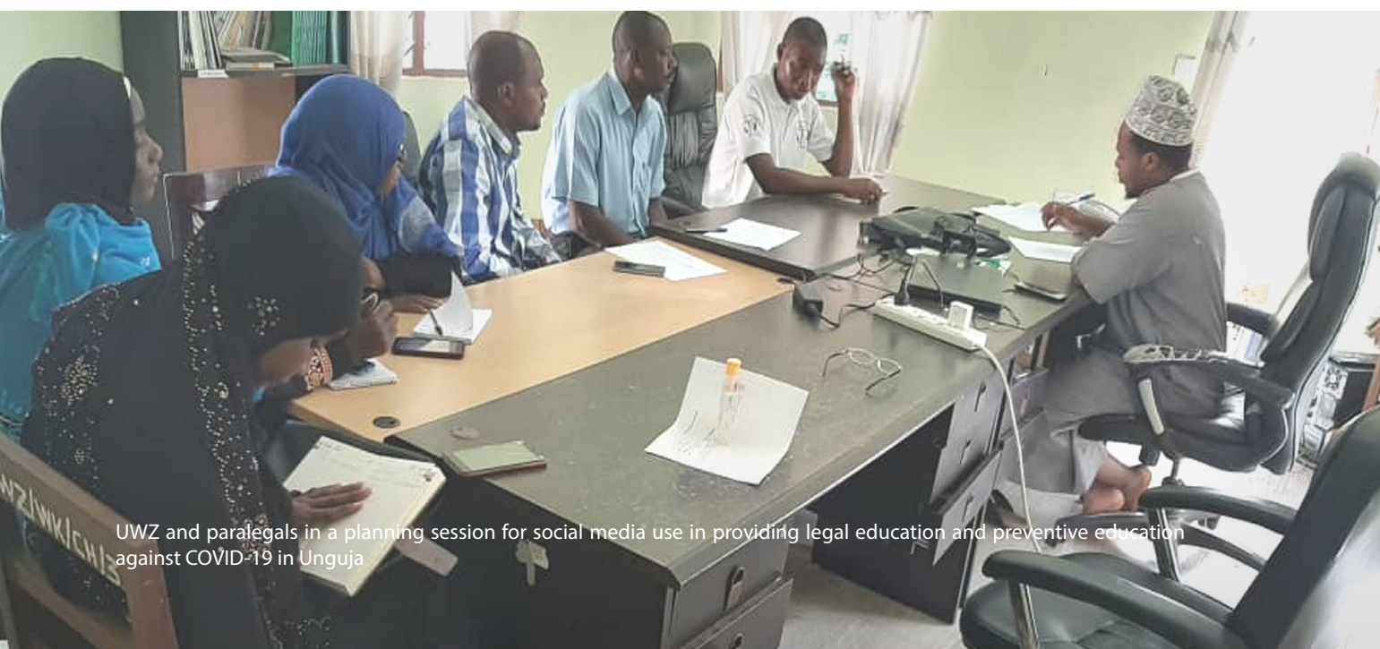
UWZ and paralegals in a planning session for social media use in providing legal education and preventive education against COVID-19 in Unguja

Both UWZ and PIRO are among 28 organizations in Mainland Tanzania and Zanzibar that are participating in various ways in efforts spearheaded by LSF to contribute to the ongoing fight against the pandemic. In addition to making a contribution to the national committee on the disease, LSF continues to oversee co-ordination of various initiatives being implemented by regional mentor organizations countrywide.