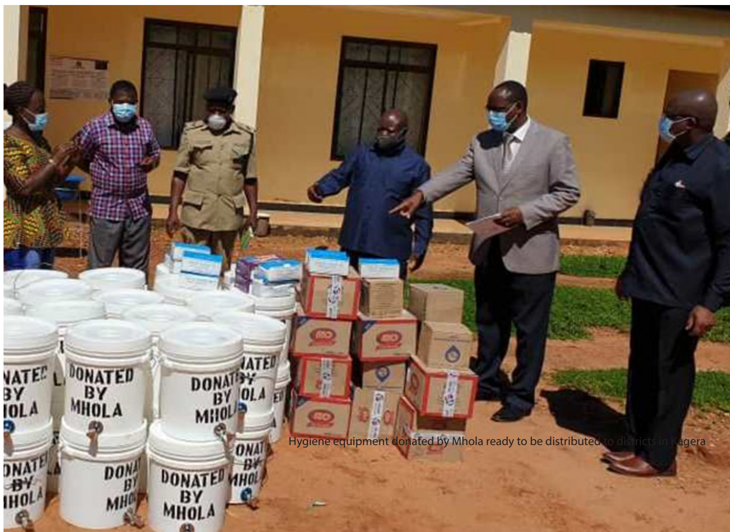
Hygiene equipment donated by Mhola ready to be distributed to districts in Kagera

All these efforts are designed to expand on LSF's desire to facilitate anti-Covid-19 initiatives around the country with the collaboration of regional organizations and paralegals whose work it funds and supports to ensure access to justice among marginalized communities.