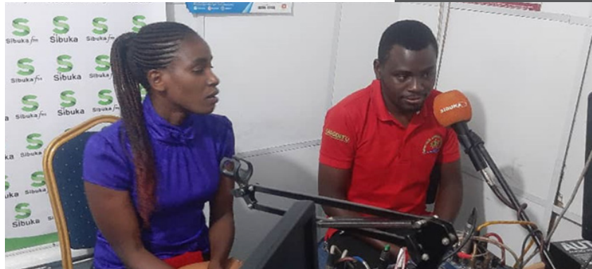
A Maswa-based paralegal, left, participates in a live radio session at Sibuka FM during a discussion on the coronavirus pandemic and the role of legal aid and education

As the presence of coronavirus continued to expand around the country, LSF encouraged organizations it funds across the country to devise means of not only availing legal aid and education with added precautions but also actively participate in the fight against the pandemic. It also provides necessary support and monitors all relevant initiatives undertaken by regional mentor organizations and paralegals against the pandemic.