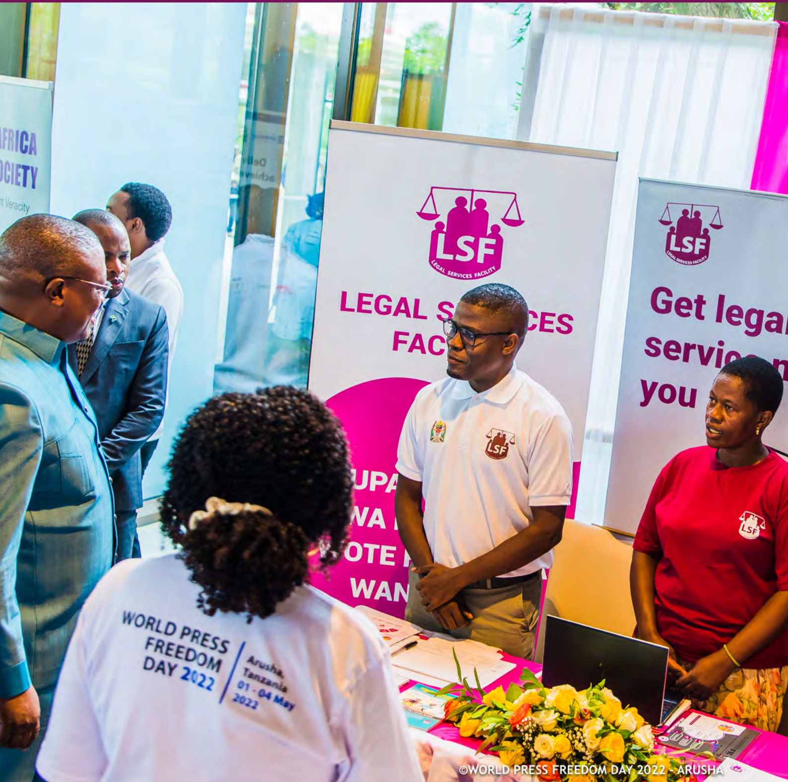
©WORLD PRESS FREEDOM DAY 2022 - ARUSHA