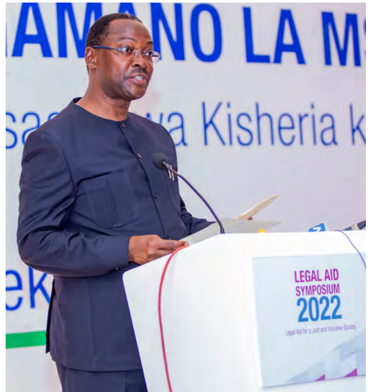
Guest of honour for 2022 Legal Aid Symposium, the then Minister of Constitutional and Legal Affairs, George Simbachawene, delivers his keynote speech as he officially opens the 2022 Legal Aid Symposium in Dodoma.

In improving the quality and effectiveness of legal aid services there is a need to roll out standardized legal training for paralegals, establishment of guidelines for the provision of legal aid in civil and criminal systems, and capacity building of legal aid providers on Alternative Dispute Resolution (ADR).