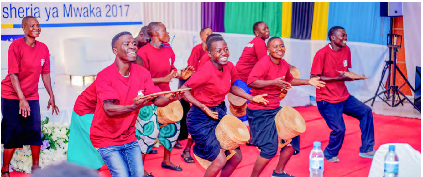
Chamwino-based Katuka Paralegal Organization dance troupe performs at the opening of the Legal Aid Symposium 2022. The troupe uses traditional music as an outreach tool for legal education.