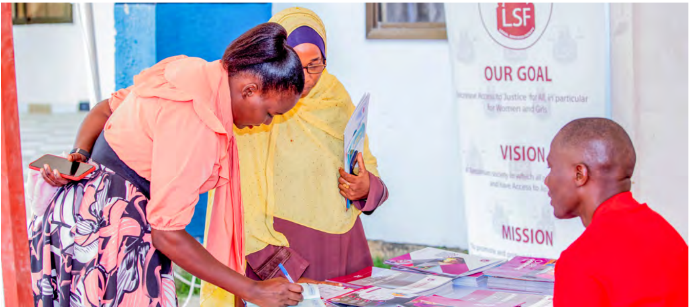
Some legal aid sector stakeholders visit the Legal Services Facility (LSF) exhibition pavilion during the launch of the 2022 Legal Aid Symposium in Dodoma.