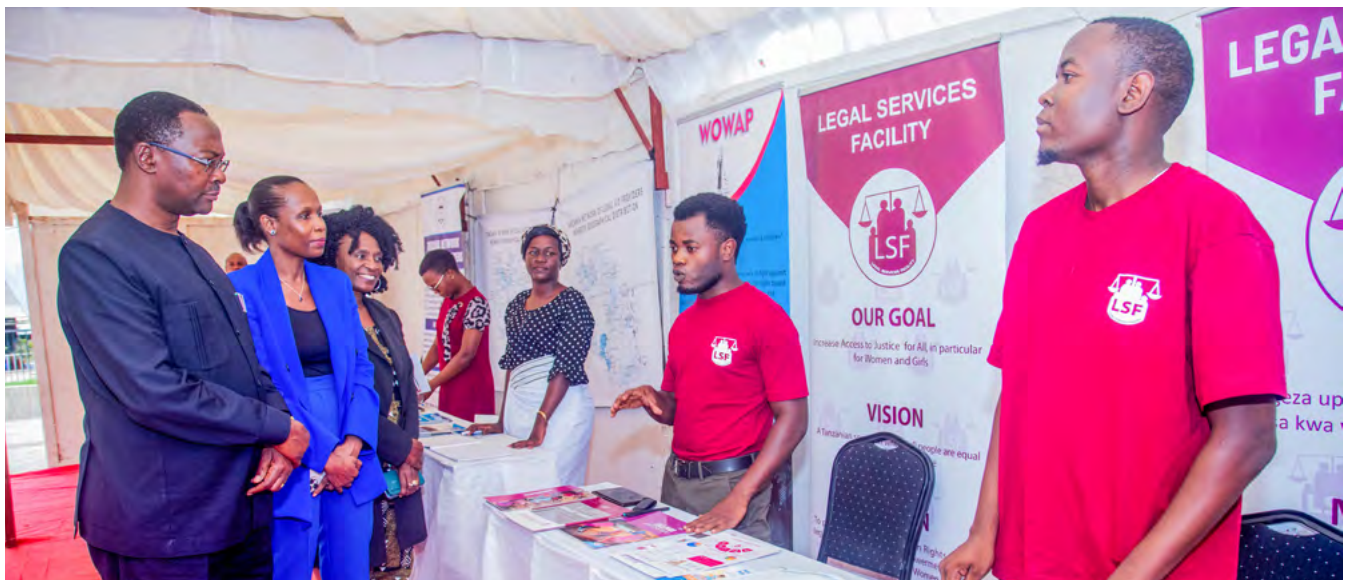
The then Minister for Constitutional and Legal Affairs George Simbachawene is briefed on paralegal work when he visited LSF's booth at the Legal Aid Symposium 2022.