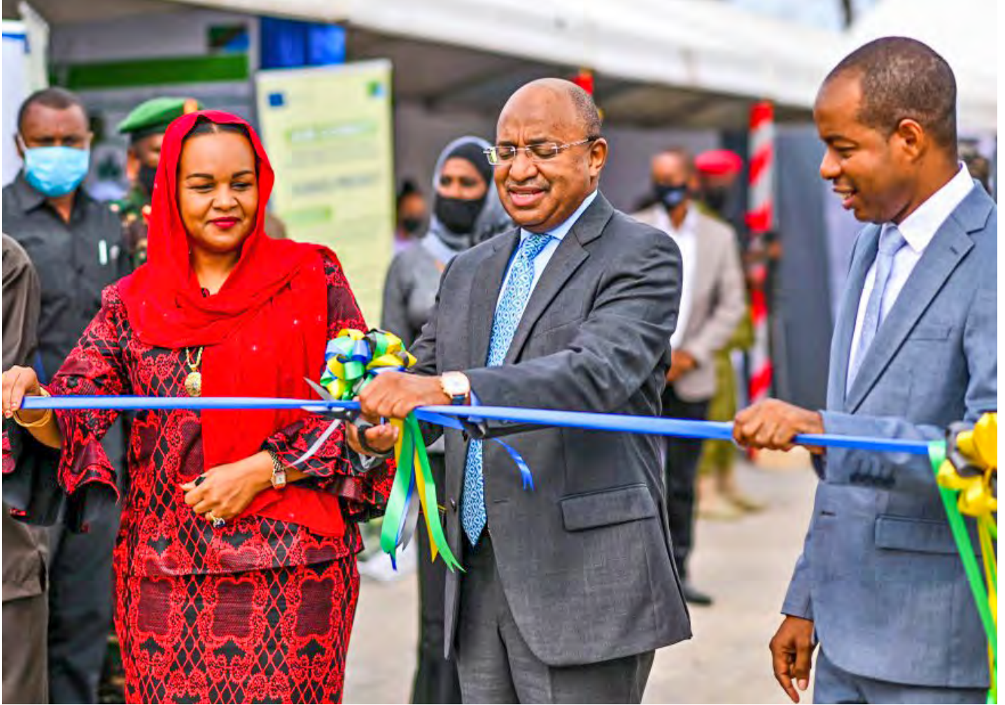
President of the Revolutionary Government of Zanzibar, Dr. Hussein Ali Mwinyi, cuts a special ribbon to launch 2022 Zanzibar Non-Governmental Organizations Forum 2022 which was themed on 'Strengthening NGOs and Governmental Partnership for the Development of Zanzibar'.

On a yearly routine the Association of Non-Governmental Organizations of Zanzibar (ANGOZA) in collaboration with the Government of Zanzibar host the Annual Non-Governmental Organizations Forum, and this year LSF extended support for the event which was held from 12 th – 14 th of March.