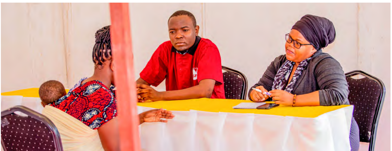
Paralegals paying attention to woman who visited a one-stop centre for free legal aid services which was the part of the 2022 Legal Aid Symposium in Dodoma that enabled the visiting public to receive legal assistance at their convenience. The legal aid services were provided by officers from the police gender desk, paralegals, lawyers from the Tanganyika Law Society (TLS) and social welfare officers from the Ministry of Social Welfare.