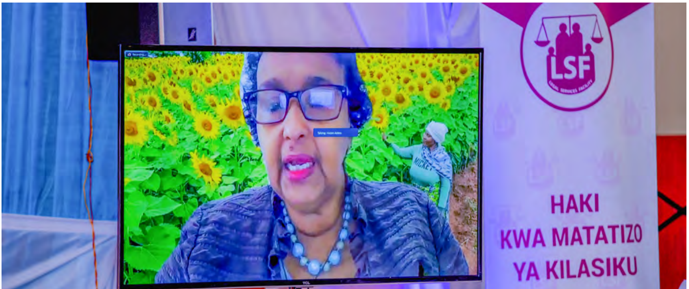
The Country Representative for UN Women in Tanzania, Hodan Addou addresses the Legal Aid Symposium 2022 virtually on women and girls' legal needs.