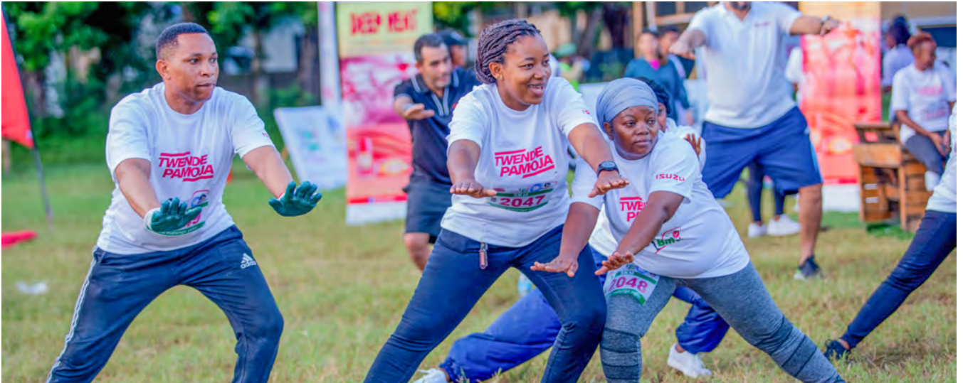
LSF staff warm up before the start of the Run for Binti Marathon.