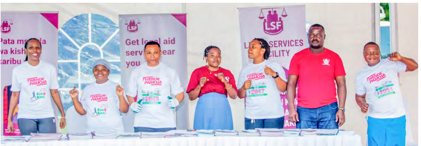
In a picture is the Legal Services Facility team of staff and paralegals during the Run for Binti Marathon organized by Smile for Community Organization in Dar es Salaam, with aims of raising funds and awareness on reproductive health rights education through commemoration of menstrual health and hygiene day.