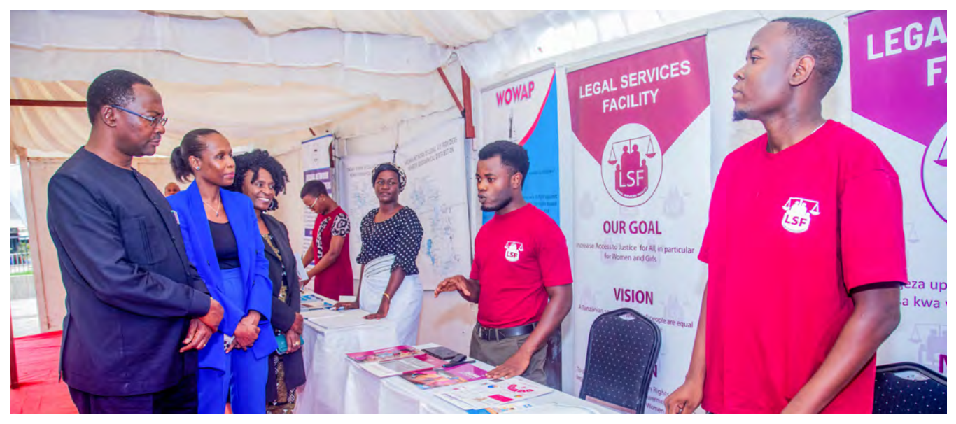
The then Minister for Constitutional and Legal Affairs George Simbachawene is briefed on paralegal work when he visited LSF's booth at the Legal Aid Symposium 2022.