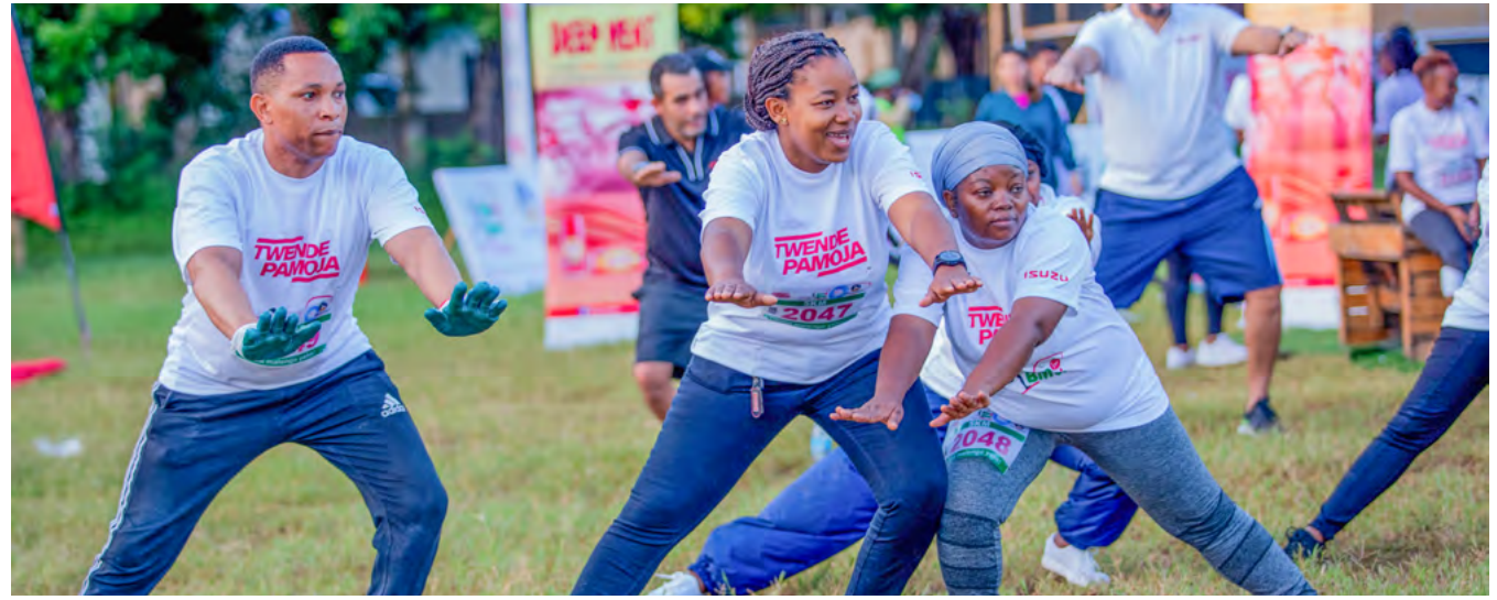
LSF staff warm up before the start of the Run for Binti Marathon.