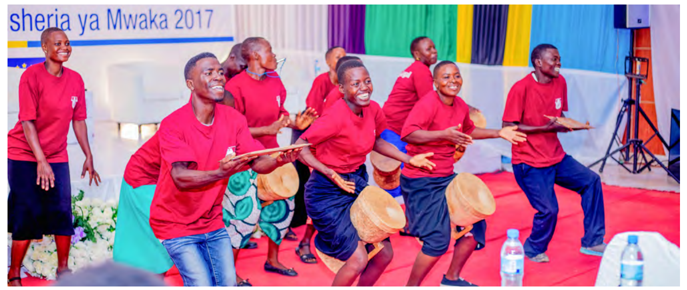
Chamwino-based Katuka Paralegal Organization dance troupe performs at the opening of the Legal Aid Symposium 2022. The troupe uses traditional music as an outreach tool for legal education.