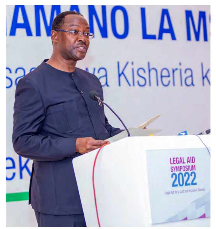
Guest of honour for 2022 Legal Aid Symposium, the then Minister of Constitutional and Legal Affairs, George Simbachawene, delivers his keynote speech as he officially opens the 2022 Legal Aid Symposium in Dodoma.

In improving the quality and effectiveness of legal aid services there is a need to roll out standardized legal training for paralegals, establishment of guidelines for the provision of legal aid in civil and criminal systems, and capacity building of legal aid providers on Alternative Dispute Resolution (ADR).