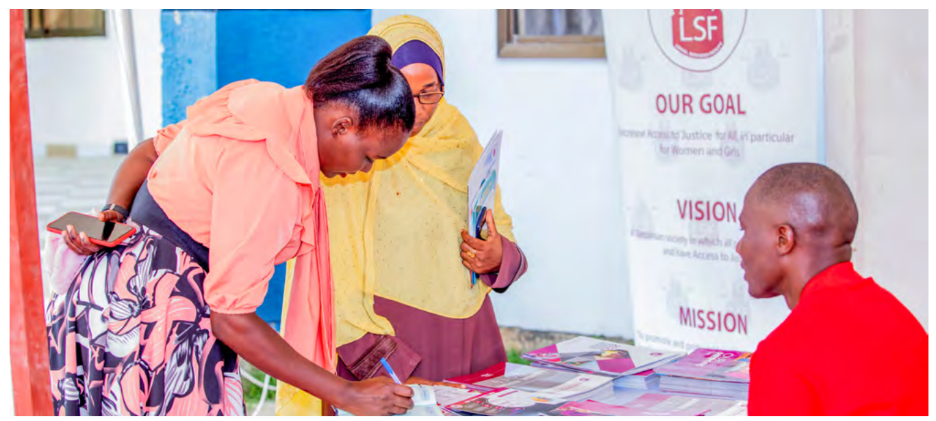
Some legal aid sector stakeholders visit the Legal Services Facility (LSF) exhibition pavilion during the launch of the 2022 Legal Aid Symposium in Dodoma.