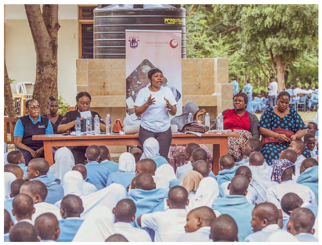
The Flaviana Matata Foundation officer educates school girls and communities at Ngokolo Secondary School based in Shinyanga region on sexual reproductive health rights and menstrual health and hygiene management to enable girls to stay in schools.

n promoting sexual and reproductive health rights the LSF in partnership with the Flaviana Matata Foundation launched and carried out a project that is instrumental in advocating for girls' rights to education through raising awareness of menstrual health and hygiene management (MHHM) in Shinyanga and Geita.